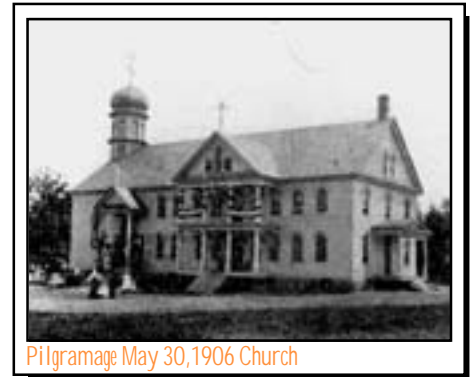
Pilgrimage May 30, 1906 Church