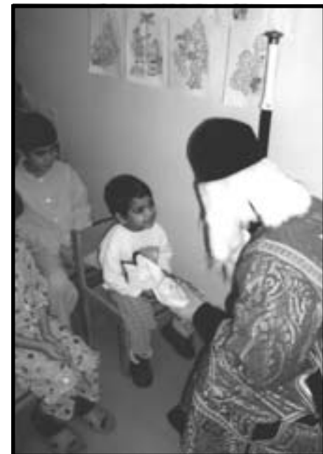
Father Christmas talking to an orphan boy in Slovakia.