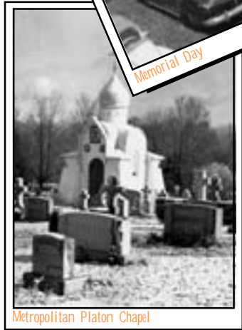
Metropolitan Platon Chapel