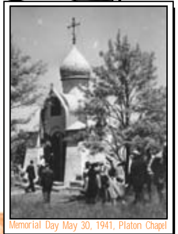
Memorial Day May 30, 1941, Platon Chapel