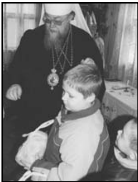
Metropolitan Sawa of Poland handing out OCA Christmas gifts.