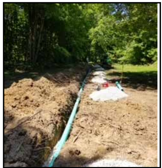
Sanitary Sewer line work

and treasures to St. Vladimir's Camp. We simply can't run our Camp without your generosity! May God repay you tenfold for your prayers and donations! If you would like to donate to Camp and have PayPal, you can send money to Camp using our email address of stvladscamp@gmail.com. We also have an Amazon Camp Wish list. Items that are purchased from the wish list can be sent directly to my house, so you don't have to worry about getting them to Camp! https://bit.ly/stvladscampoh