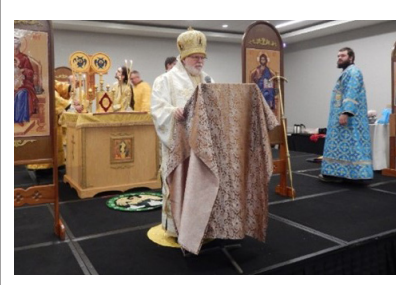
Homily at the 93rd National Convention, Columbus, Ohio in 2019