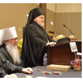
Archpastoral greetting in 2016 at the 90th National Convention in Chicago