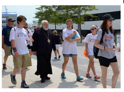
Youth trip to the Navy Pier and other local sites.